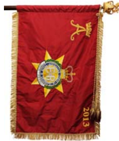
Figure 5–10: Displaying a single Banner during a Regimental Dining in night

When a single Standard, Guidon, Colour or Banner is displayed it is positioned so as to show the obverse side; that is, with the Banner to the right of the pike ( see figure 5–10).